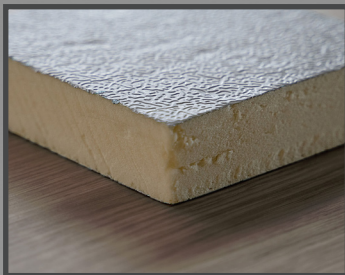
35mm PIR fire retardant insulation

These doors are constructed with the same high-quality steel as our premium PA doors, but with the added benefit of insulation and double-sided COLORBOND skins for increased energy efficiency and protection.